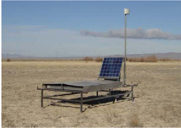
Figure 1. A scintillation surface detector deployed in the field for the Engineering Array test.

Scintillator platforms are to be constructed of 2 inch square tubular steel legs and frame. Scintillators with fibers and PMTs will be contained in a 2.3m x 1.7 m x 10cm high stainless steel box, which lies on top of the platform and is covered with a thin steel roof in order to avoid sunlight and rain. The solar panel is installed on top of the platform at a 60 degree angle. Behind and below the solar panel will be a metal enclosure containing the storage battery and electronics boards. A lightweight 10 ft. antenna would be attached to each platform. The over-all dimensions of each detector is 7 ft. wid, 12 ft. long, and 6 ft high (not including the antenna).