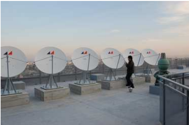
Figure 3: Photograph of the parabola for detection of MBR from EAS. 12 parabolas are located on a roof of university building.

Based on the results from the simulation described above, we have developed an MBR observation system. This system composed of 12 off axis parabolas (NIPPON ANTENNA CS-S120K). Diameter of this parabola is equivalent to 1.2 m which is decided to maximize signal to budget