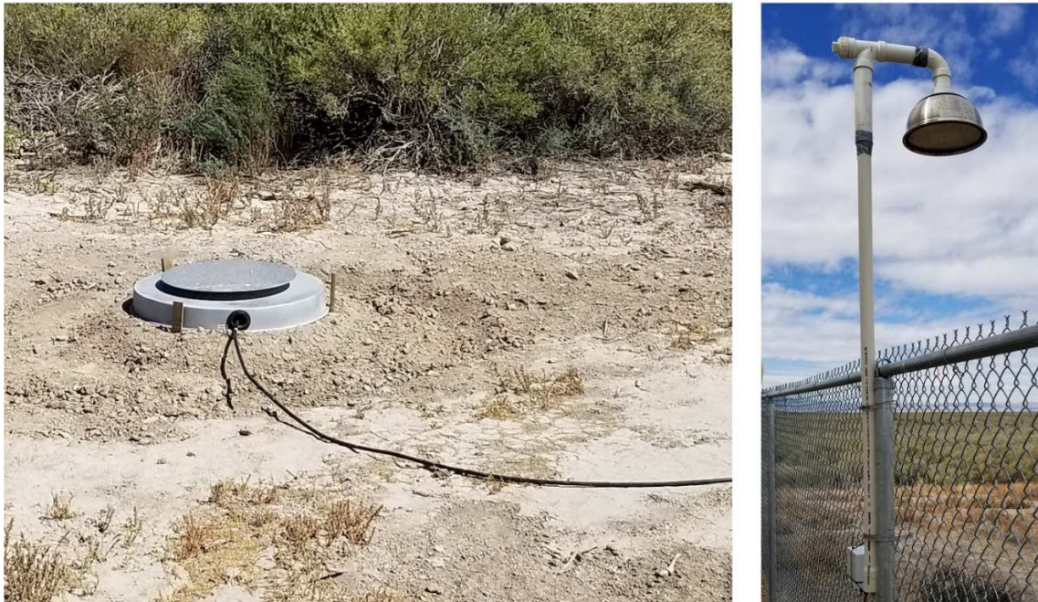
Figure 2: Left: One of three flat-plate antennas, on a 120 m triangular base, recording VHF between 20-80 MHz for the broadband interferometer system. Right: Fast antenna “sferics sensor”, recording electric field changes at 180 MHz.

Motivated by the previous findings, new lightning detection equipment was added to the suite of instruments at Telescope Array in the summer of 2018. This equipment is shown in the photographs in Figure 2, and an example of the interferometer data for an energetic cloud-to-ground lightning strike is shown in Figure 3.